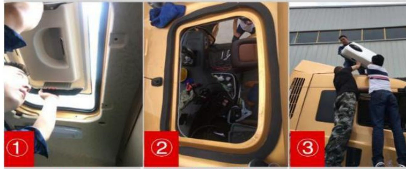
Remove the skylight of the car

1. Very easy to install, usually it needs 1 hours to install well!